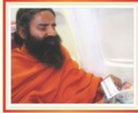
Baba Ram Dev